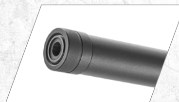
Pre-threaded 5/8x24 muzzle with knurled thread protector.