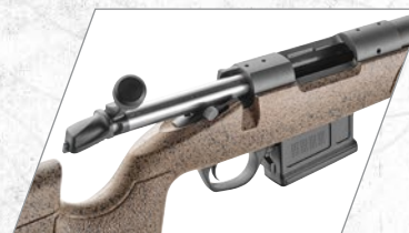
Featuring our one-piece smooth and durable B-14 Action.