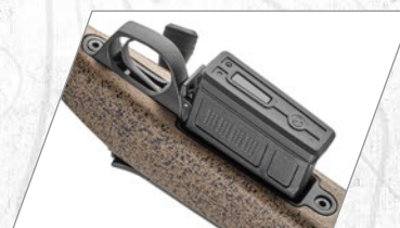
AICS detachable magazine.