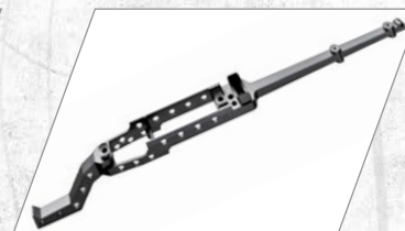
Integrated mini-chassis for repeatable bedding and accuracy.