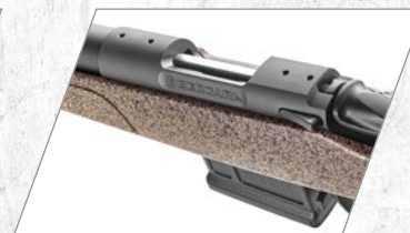
Scope mount fits Remington 700 rings and bases.