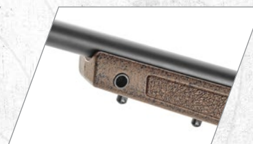
Integrated QD flush cup sling mounts.