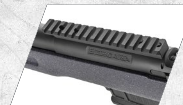
20 MOA Picatinny scope mount.