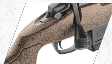
Bergara Performance Trigger.

CALIBER/TWIST: .308 WIN/1:10, 6.5 CREEDMOOR/1:8