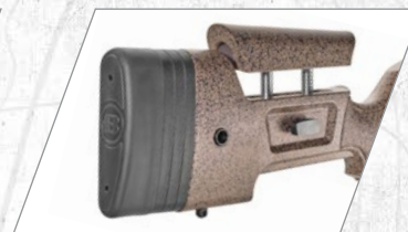
Butt-stock features an adjustable cheek piece and length of pull spacers.