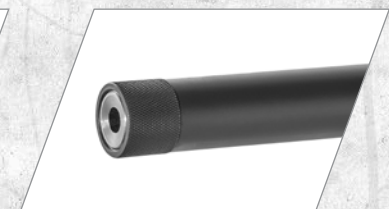
Pre-threaded 5/8x24 muzzle with knurled thread protector.