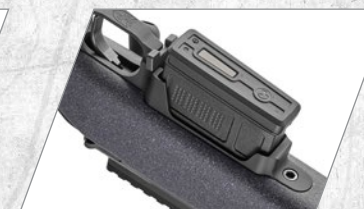
Integrated mini-chassis for repeatable bedding and supports fully free-floated barrel.