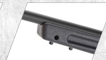
Four integrated QD flush cup sling mounts.